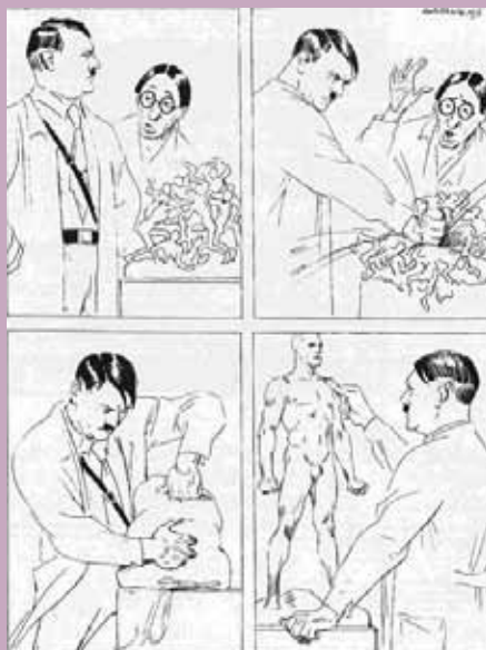
"The Sculptor of Germany" O. Garvens, Kladderadatsch, 1933, volume 46